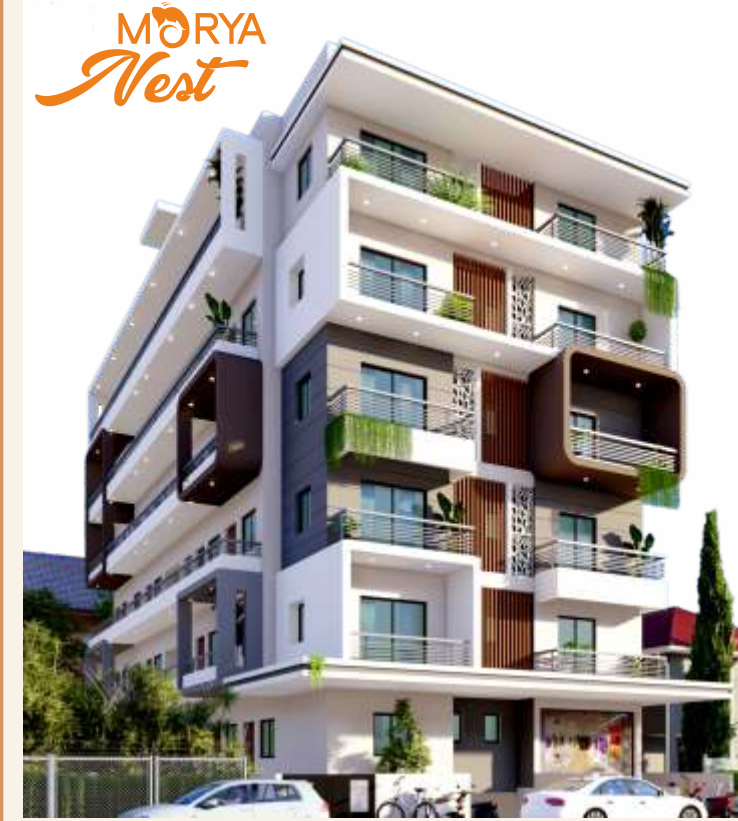
CTS No. 5028, 5029, Wada Compound, Angol, Belgaum

When you become part of Morya Enclave you become a part of residences that offer a class apart lifestyle that is specially designed to give you matchless luxury.